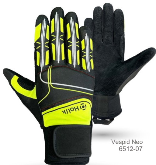
Vespid Neo 6512-07