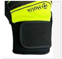
NEO - VELCRO CUFF