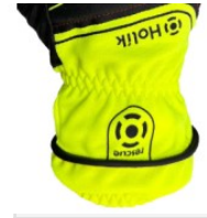
EVO - ELASTIC CUFF