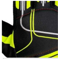
EVA - FOAM