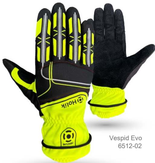
Vespid Evo 6512-02

Designed for ultimate flexibility, these gloves offer minimal restriction and maximum comfort. They are lightweight yet durable, providing protection against mechanical and contact heat hazards in the palm, along with impact protection on the back of the hand.